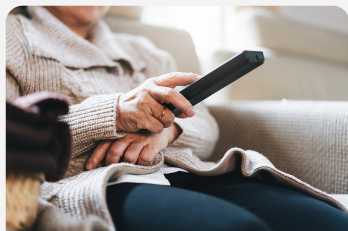
Pausing TV to explain who characters are