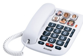
Telephone with photo buttons to choose who to call