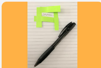
Adjustable frame made of post-its to help with writing signature