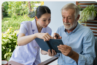
Speech and language therapy