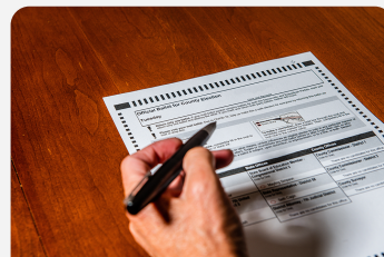
Registering for an absentee ballot to vote from home