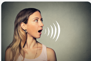
Speaking slowly and clearly