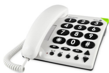
Large-button landline telephone

If you are connected to the internet, clicking on a strategy will take you to the website where you can find more PCA tips and strategies.