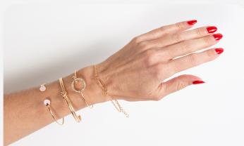
Re-labelling left and right arm e.g. 'bracelet arm'