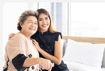
Sitting down while dressing