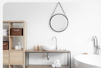
Keep only products used daily out on display