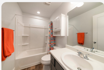
Colour contrast towels and bathmat in bathroom