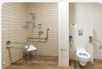
Stool for showering/grooming