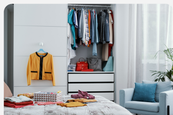
Laying clothes out on bed first