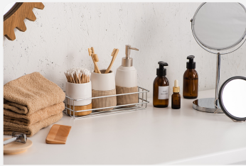
Bathroom products lined up in order of use