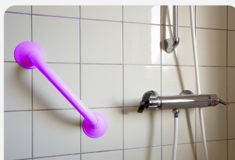
Colour contrast fixtures in bathroom