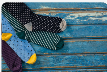
Socks with different coloured toes and heels