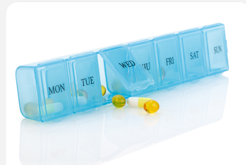
Using a dosette box for medication