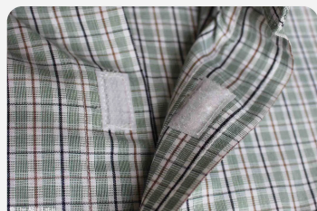
Clothes with simpler fastenings

If you are connected to the internet, clicking on a strategy will take you to the website where you can find more PCA tips and strategies.