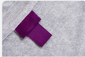
Contrasting labels to indicate front/ back of clothing items