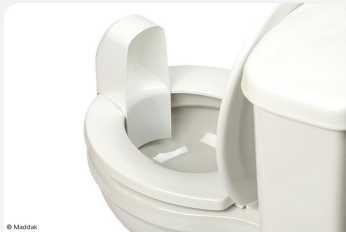
Splash guard for toilet