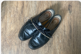
Elastic bands around pairs of shoes