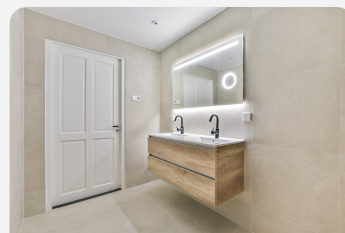
Keep bathroom light on