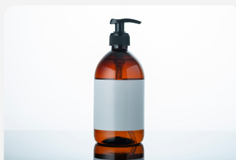
3-in-1 shampoo, conditioner and body wash