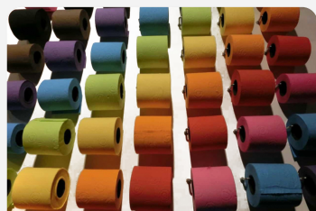
Coloured toilet paper